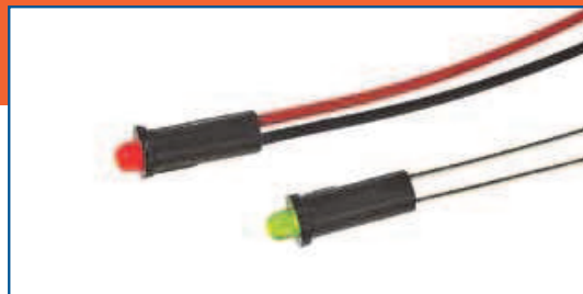
3mm Panel Mount LED Assemblies