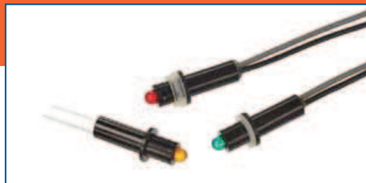
3mm Panel Mount LED Assemblies